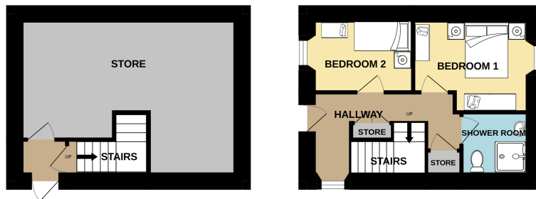
GROUND FLOOR AS EXISTING & SKETCH PROPOSAL